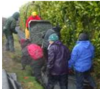
laying the new path