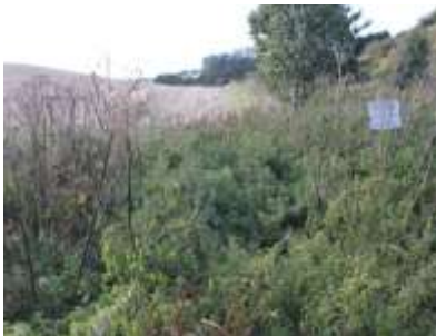
overgrown in Autumn 2012

The Burnside Path..... is now ready for you to walk !