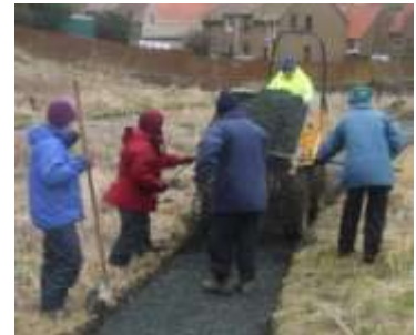
last few loads