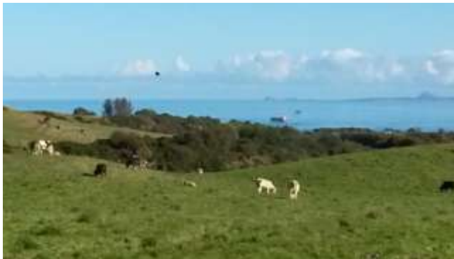
View from Rodanbraes path over farm fields to the Bass Rock, Fidra and Berwick Law.